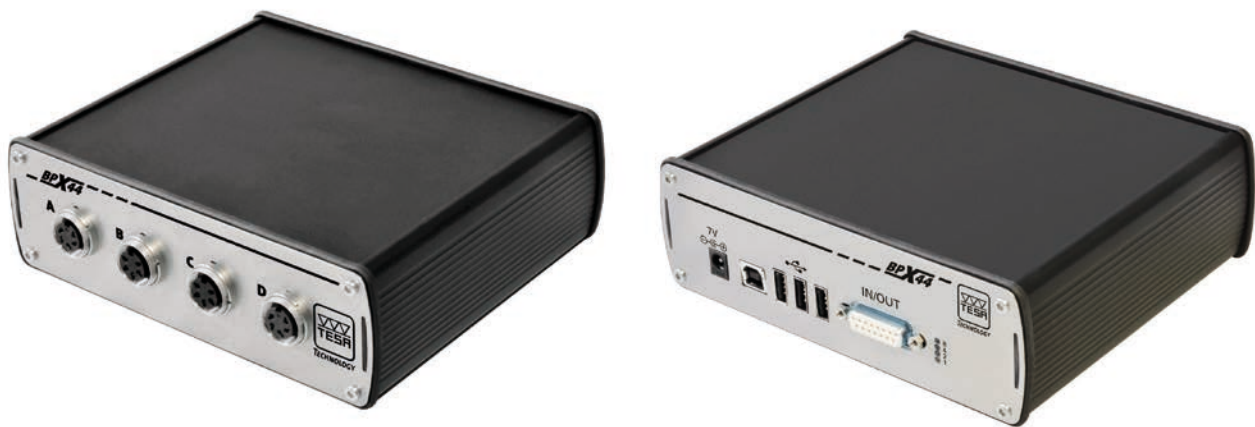
BPX interface, front and back faces